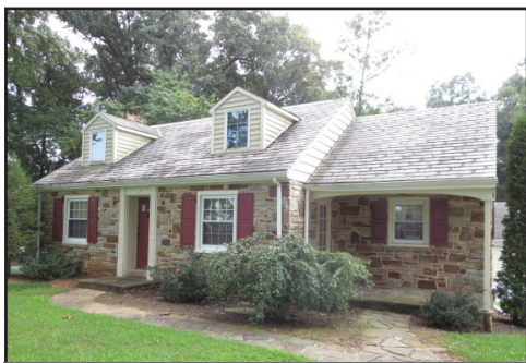
REAL STONE HOUSE