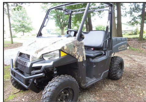
2015 POLARIS RANGER

Located at: 3848 S. Blackhorse Rd. Parkesburg Pa 19365