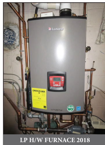
LP H/W FURNACE 2018

Please visit our website at www.martinandrutt.com