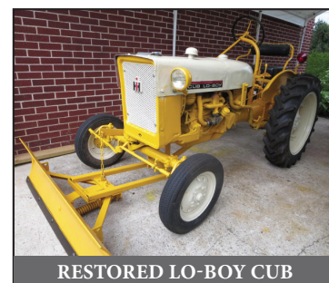
RESTORED LO-BOY CUB

AUCTION BY: MARTIN & RUTT AUCTIONEERS AY2189