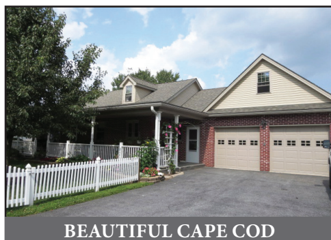
BEAUTIFUL CAPE COD

THURS. OCT. 4, 2018 @ 5:00 PM * RE @ 6 PM