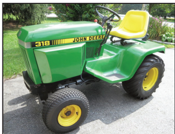
JOHN DEERE 318

Located at: 47 West Mohler Church Rd. Ephrata, Pa 17522