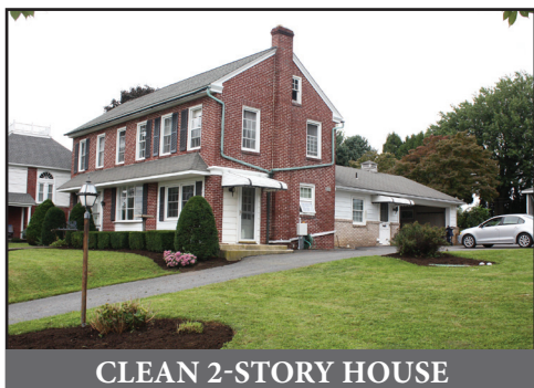
CLEAN 2-STORY HOUSE