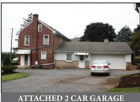
ATTACHED 2 CAR GARAGE