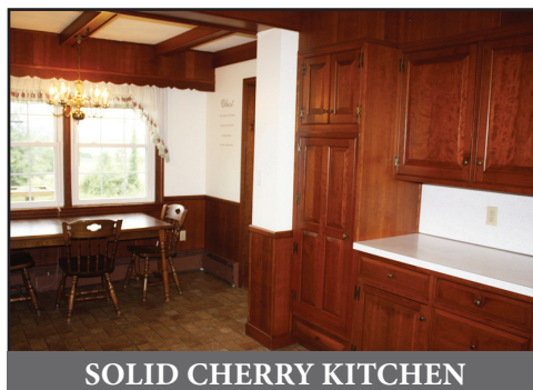
SOLID CHERRY KITCHEN

Located at: 4488 Division Highway, East Earl Pa 17519