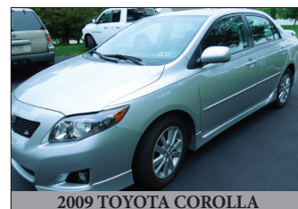
2009 TOYOTA COROLLA

Terms: Cash, PA check or credit card w/3% admin fee. Food stand provided; sale held under tent, bring a chair; all sale day announcements take precedence over any prior ads.