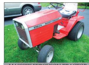
MASSEY FERGUSON TRACTOR