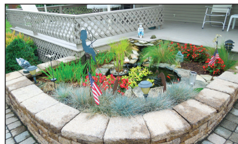
PROFESSIONAL STONE PATIO

Located at 1244 Springville Rd. East Earl, Pa. East Earl Twp. Lancaster Co.