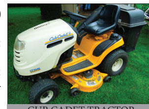
CUB CADET TRACTOR