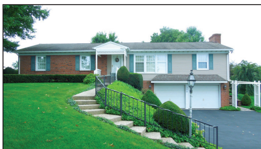
1,736 SQ. FT. CUSTOM RANCHER • .98-AC LOT