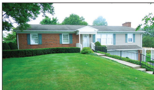
3-BR BRICK & VINYL RANCHER

3-BDRM BRICK & VINYL RANCHER w/2-CAR GARAGE * 1-AC. LOT 09 TOYOTA COROLLA * MF & CUB CADET LAWN TRACTORS TOOLS * ANTIQUES * GLASSWARE * PERSONAL PROPERTY SAT. OCT. 27, 2018 @ 9-AM / Real Estate @ 1-PM