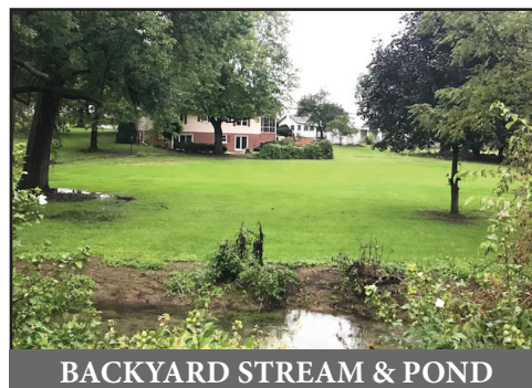
BACKYARD STREAM & POND

Located at: 1790 Donegal Springs Rd. Mt. Joy, Pa. 17552