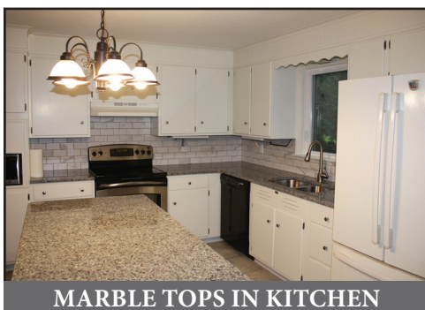
MARBLE TOPS IN KITCHEN