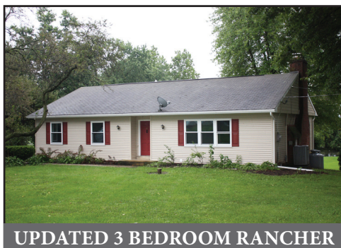
UPDATED 3 BEDROOM RANCHER