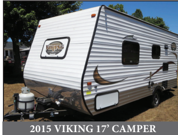
2015 VIKING 17' CAMPER