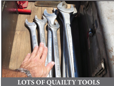
LOTS OF QUALITY TOOLS