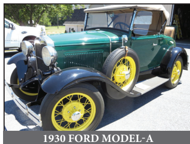
1930 FORD MODEL-A