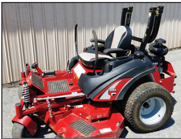
FERRIS IS-2100Z MOWER