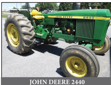
JOHN DEERE 2440