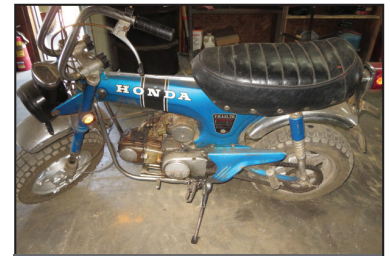
HONDA #70 TRAILBIKE