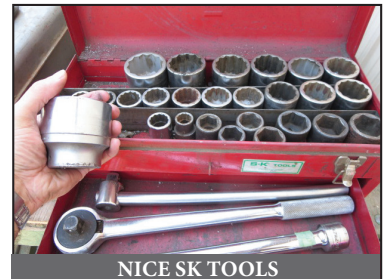
NICE SK TOOLS

GUNS & PERSONAL PROPERTY: Weatherby 300 Winchester Mag. rifle w/ 3x10 scope & SS barrel; Marlin #882 .22 rifle w/ SS barrel; Stevens #77 12 ga. pump w/ silencer; J. Stevens .32 rifle w/ hex barrel; Winchester #69A .22 bolt ac. Rifle; Remington #870 12 ga shotgun & extra slug barrel; Thompson Center .50 cal. flintlock rifle; Crescent 12 ga. double barrel shotgun; H & R #929 double barrel; Savage model I .22 bolt ac. rifle; Marlin .22 bolt ac. rifle; Enforcer fireproof digital gun safe; beautiful Moose shoulder mount; Elk shoulder mount; misc. Whitetail mounts; Black Bear shoulder mount; deer cart; (45) foot & body traps; (2) 1-person kayaks & ors; Rattan glass-top table & 4 chairs; Starburst queen size hand-made quilt; Dresden Plate quilt top; Caterpillar pedal bulldozer on tracks; old A/C D-14 pedal tractor; Yellow John Deere Indus. Pedal tractor (Ertl); old Power-Trac tin pedal tractor; (2) LP patio heaters; LP patio firepit; air tire wagon; Air Knight pedal airplane; old church bench; Tinker toys; Fisher-Price toys; Uncle Arthur's book series; Brass bulldog doorstop; old tin child's steam shovel; balance scales; old glass fly trap; old glassware; collectibles; old watering can; large pile of split firewood; chicken crate; plus much more unlisted. Please bring a chair.