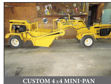
CUSTOM 4x4 MINI-PAN

Located at: 551 Stevens Rd. Ephrata Pa 17522