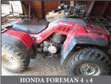
HONDA FOREMAN 4 x 4