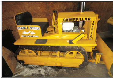
CUSTOM MINI DOZER