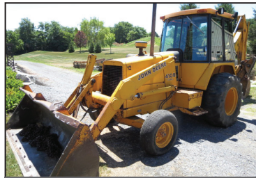
JD 410-B BACK-HOE