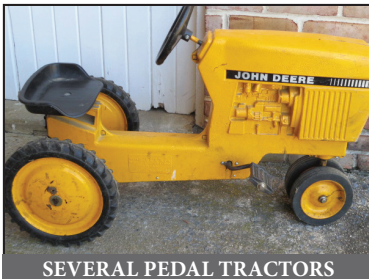
SEVERAL PEDAL TRACTORS