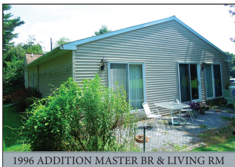
1996 ADDITION MASTER BR & LIVING RM