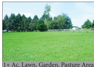
1+ Ac. Lawn, Garden, Pasture Area