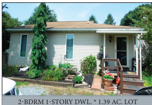
2-BDRM 1-STORY DWL. * 1.39 AC. LOT