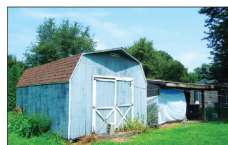
CUSTOM KITCHEN W/ISLAND BAR

Outbuildings: include a 16'x21' pony barn; a 14'x18' utility barn; large level garden & pasture area.