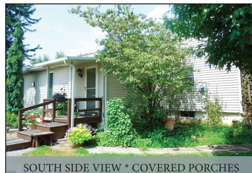
SOUTH SIDE VIEW * COVERED PORCHES

Located at 668 S. Broad St. Honey Brook, Pa. (Cambridge) Salisbury Twp. Lancaster Co.