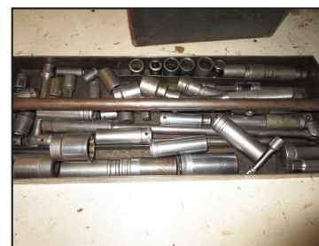
OLDER SNAP-ON TOOLS

Please visit our website at www.martinandrutt.com