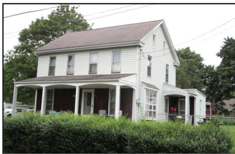
2.5 STORY HOUSE