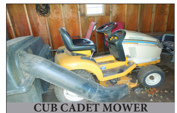
CUB CADET MOWER