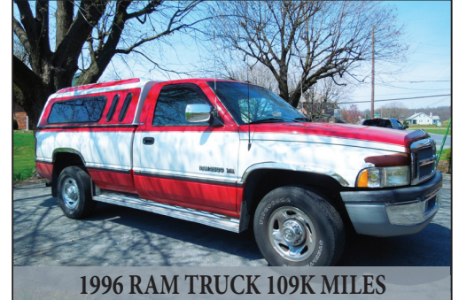
1996 RAM TRUCK 109K MILES

Located: 101 Hahnstown Rd. Ephrata, Pa. Ephrata Twp. Lancaster Co.