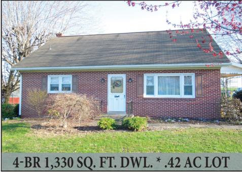
4-BR 1,330 SQ. FT. DWL. * .42 AC LOT

SATURDAY, MAY 26, 2018 @ 9:00 AM/Real Estate @ 1PM