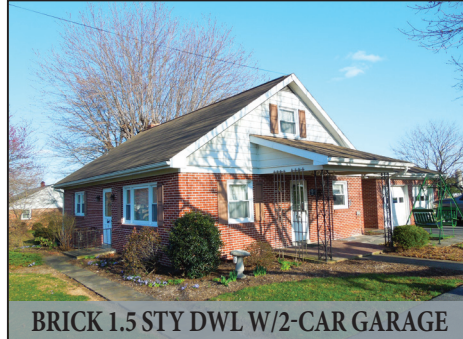
BRICK 1.5 STY DWL W/2-CAR GARAGE