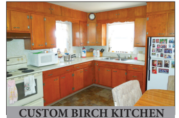
CUSTOM BIRCH KITCHEN

TERMS: Cash, PA check or credit card w/3% admin fee. Food stand; sale held under tent bring a chair. All sale day announcements take precedence over any prior ads.