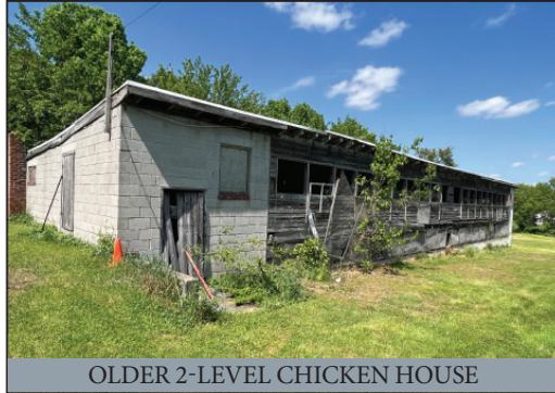
OLDER 2-LEVEL CHICKEN HOUSE