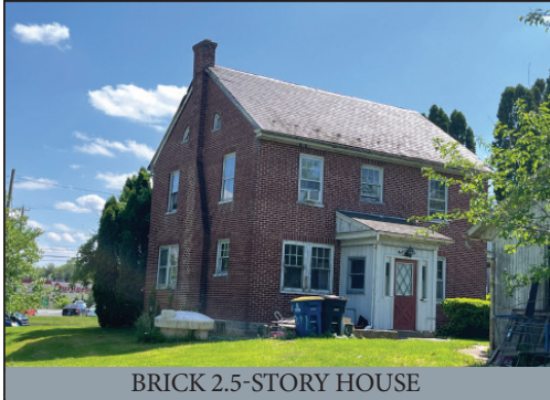
BRICK 2.5-STORY HOUSE