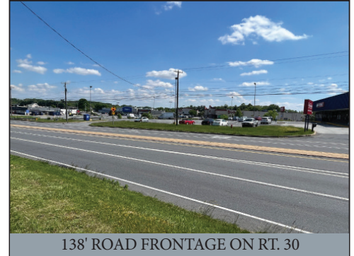
138' ROAD FRONTAGE ON RT. 30

LOCATED AT: 2081 Lincoln Hwy East, Lancaster PA 17602 * E. Lampeter Twp