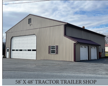
58' X 48' TRACTOR TRAILER SHOP