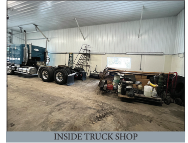
INSIDE TRUCK SHOP

Located at 2613 Heidelberg Ave. Newmanstown PA 17073 * Heidelberg Twp. * Lebanon County