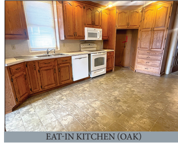
EAT-IN KITCHEN (OAK)