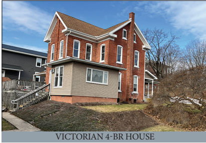
VICTORIAN 4-BR HOUSE

58' x 48' LARGE TRUCK GARAGE/SHOP * FLOOR HEAT 2.5-STORY HISTORIC 4-BR BRICK HOUSE * .89-ACRE TRACTOR TRAILER MACADAM PARKING AREA * CORNER LOT THURSDAY, APRIL 25, 2024 @ 6:00 PM