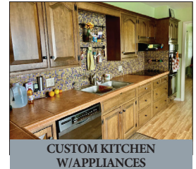
CUSTOM KITCHEN W/APPLIANCES

Note: Very attractive stone & vinyl dwelling w/2-garage along a side street yet close to all amenities! Home features many recent valuable updates throughout; nice level corner lot w/private fenced yard opposite Garden Spot High School.