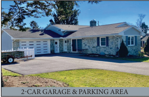
2-CAR GARAGE & PARKING AREA

1,870 Sq. Ft. 2-BDRM 2.5-BATH STONE SPLIT-LEVEL HOME 2-CAR GARAGE * 12'x16' UTILITY SHED * .47-ACRE LOT GUNS * TRAILER * TOOLS * QUILTS * PERSONAL PROPERTY SAT. APRIL 20, 2024 @ 9-AM/Real Estate @ NOON