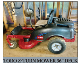
TORO Z-TURN MOWER 36" DECK