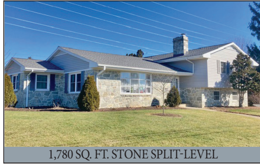
1,780 SQ. FT. STONE SPLIT-LEVEL