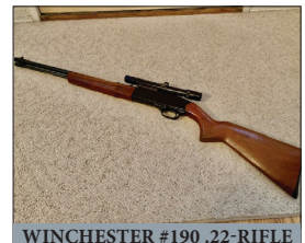
WINCHESTER #190 .22-RIFLE