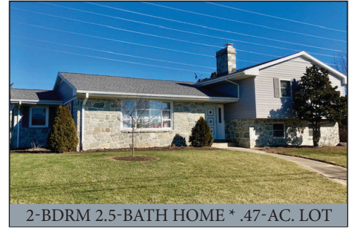
2-BDRM 2.5-BATH HOME * .47-AC. LOT

Located at 600 Grandview Dr. New Holland, Pa. Lancaster Co.