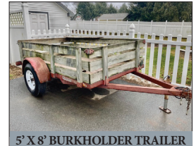
5' X 8' BURKHOLDER TRAILER