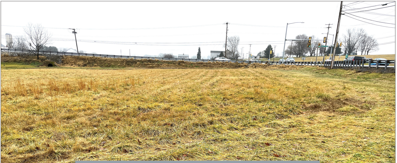
1.56 CORNER LOT AT A TRAFFIC LIGHT

Located at 721 Horseshoe Pike, Annville PA 17003 * South Lebanon Twp.