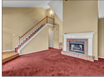
LIVING ROOM W/ 15' CATHEDRAL