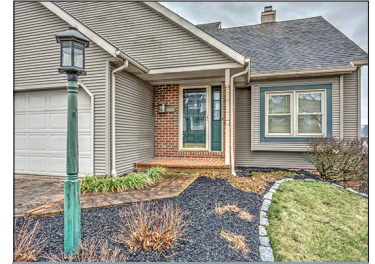
1-OWNER CUSTOM BUILT HOUSE

Located at 189 Windsor Dr. Ephrata, PA 17522