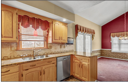
BEAUTIFUL OAK CUSTOM KITCHEN

VERY NICE 1.5-STORY HOUSE * DECK W/ VIEW CAPE-COD w/ 3-BR's * 2.5-BATHS * 2-CAR GAR. CATHEDRAL CEILING * M/L BEDROOM & BATH THURSDAY, APRIL 11, 2024 @ 6:00 PM