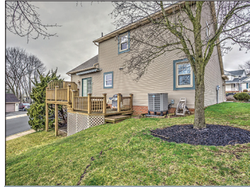
BACK OF HOUSE & DECK W/ VIEW