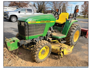
JOHN DEERE 4300 1,089-HRS

VEHICLES & EQUIPMENT: Silver 2020 Chevy Silverado LT pickup w/ 4WD, full crew cab, 5.5' bed, 47-k miles (few bumps); John Deere 4300 utility tractor w/ 4WD, 3-pt. hook up, 72" belly mower deck, 1089 hours, 3 suitcase weights, runs great; Howse 68" roto tiller w/ 3pt. attach.; John Deere gator w/ 4x2, gas engine, dump bed; Walker S-18 zero-turn mower w/ 98 hours, 18-HP, grass catcher, 48" deck; Bobcat model 773 skid-steer loader w/ 6900 hours, (runs good); 2013 Black Chevy Equinox w/ 159k miles, runs but needs body work; 2013 Burkholder deck-over trailer w/ 10k GVW (needs new deck); Big-Tex 35-SA 12'x6' utility trailer w/ lay-down ramp; pallet forks w/ quick attach.; Oliver 3-pt. 2-btm plow; 14'x 12' newer run-in shed (Martin buildings); 16'x 10' dog kennel w/ outside run (older); dog whelping pen; Kubota 1635H lawn tractor w/ liquid cooled diesel engine, 4-wheel steering, 60" cut; Cub Cadet TX1045 lawn tractor w/ hydro, 20-HP, 46" cut; Ex-Mark zero-turn mower w/ 48" cut; JD LA-145 lawn tractor; Husq. Z246 zero-turn mower, as-is; Husq. YTH 24v54 zero-turn mower, as-is; JD D-140 lawn tractor w/ 48" cut, 200 hours; JD LA-150 lawn tractor (as-is); other lawn tractors as-is; Troy-bilt Pony size tiller