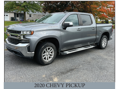
2020 CHEVY PICKUP

Located at 110 Rock Rd. Ephrata PA 17522