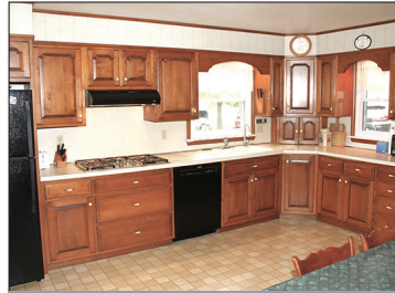
ROOMY EAT-IN KITCHEN