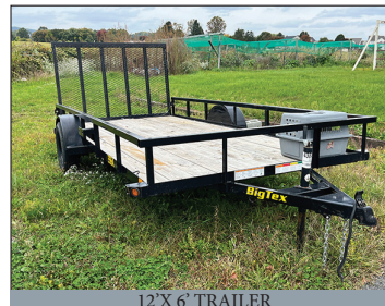
12 X 6' TRAILER