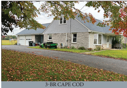
3-BR CAPE COD

SATURDAY, MARCH 30, 2024 @ 8:30-AM * R.E. @ 1:00-PM