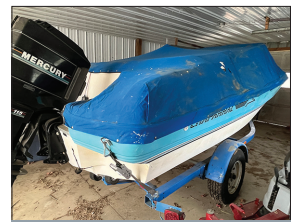
17' CHAPARRAL 115-HP