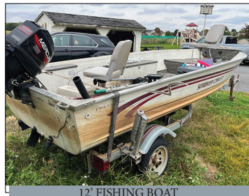
12' FISHING BOAT