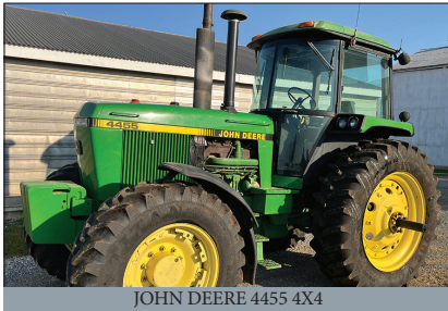
JOHN DEERE 4455 4X4