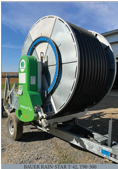
BAUER RAIN-STAR T-42, T90-300