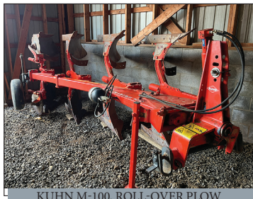
KUHN M-100, ROLL-OVER PLOW