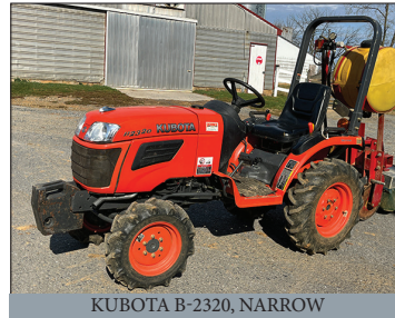
KUBOTA B-2320, NARROW