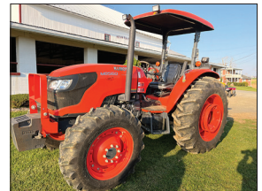
KUBOTA M-8560, 224-HR'S