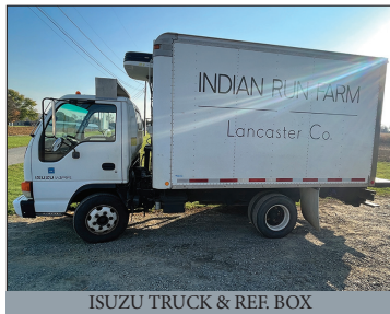
ISUZU TRUCK & REEF BOX