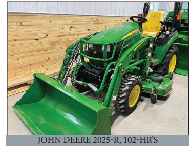
JOHN DEERE 2025-R, 102-HR'S

Located at 550 Stevens Rd. Ephrata PA 17522