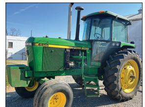
JOHN DEERE 4455, 4X2