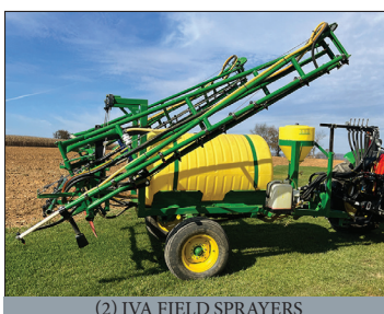
(2) IVA FIELD SPRAYERS