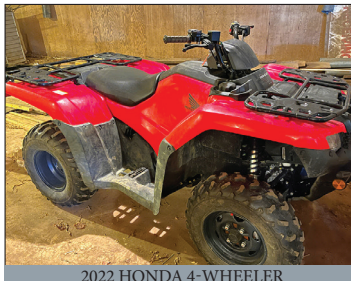
2022 HONDA 4-WHEELER