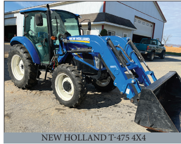
NEW HOLLAND T-475 4X4