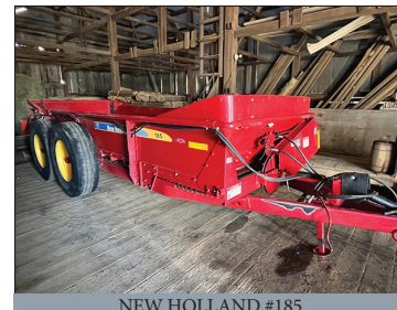
NEW HOLLAND #185

planter w/ custom plastic layer & sprayer; Rain-Flow #1600 2-row transplanter has (2) 80-gallon poly tanks w/ custom planter wheels; tobacco transplanter; 3-pt orchard sprayer w/ ploy tank; 3-pt hooded-sprayer w/ narrow roller; Rain-Flow #2570 plastic mulch layer, double drip, raised bed attachment & row filler; PBZ plastic wrapper/lifter for sweet corn; Rain-Flow #1800 3-pt plastic lifter w/ spring reset; (2) 3-pt stand-on, plastic wrapper; older wire-hoop straightener; 3-pt 38" Bush-Hog mower (squealer); (100+) Mathieson #420 & #520 alum. irrigation pipe (20' & 30'); 3-point Brillion small seeder; 1-row pumpkin planter; 3-pt Pioneer 1-bottom plow; 3-pt landscape box drag; Conestoga 25-Bu. mini manure spreader, ground drive; (7) custom small pickup body utility trailers; (2) I & J 2-row cultivators; (2) rotary-hoes; 3-pt PBZ single bale spear; (2) 3-pt Rain-Flow flat-bed plastic layer; 3-point plastic hoop setter; PTO Caprari 3.65, irrigation pump; (2) dig. cash registers; produce tables; (500+) HD tomato cages & pepper stakes; (1,000+) metal wire produce hoops; misc. cardboard bins & boxes; plus more unlisted.