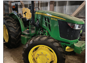
NEW JD 5075-E, 5-HR'S

PRODUCE EQUIPMENT: BAUER Rain-Star T-42 T90-300 w/ 985' 3" hard hose reel w/ Nelson SR 150-big gun & Eco-Star 4000S control system w/ battery & solar panel; AZS 24" wide, 3-section S.S. produce brusher/washer & sorting table; IVA MFG crop sprayer w/ 45' double boom, 300-gallon, roller pump, foam maker, 5-zones & crank lift; IVA MFG produce sprayer, 50' hydro fold 90" lift booms, John Blue 23.0 GPM-725 PSI diaphragm pump, 5-sections, 300-gallon, 5-zones; Agrex 3-pt spin-spreader w/ poly hopper; BEI irrigation pump, 3.7 Cummins diesel, 941 hrs, 500-G-min Berkley pump, HD primer, mounted fuel tank; JD irrigation pump, diesel engine, 4,600-hrs, 500-G-min Berkley pump, HD primer w/ mounted fuel tank; JD 2-row sweet corn