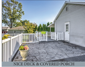
NICE DECK & COVERED PORCH