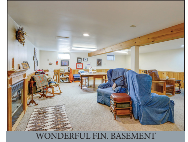
WONDERFUL FIN. BASEMENT

Located at 31 Kevin Court, Leola PA * Upper Leacock Township