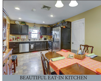
BEAUTIFUL EAT-IN KITCHEN