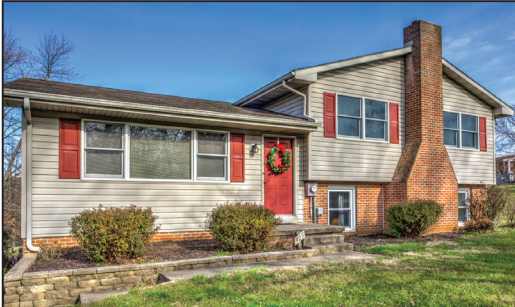
CLEAN 3-BR SPLIT-LEVEL