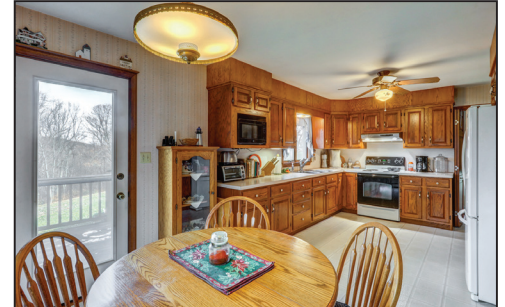
SPACIOUS EAT-IN KITCHEN

Located at 325 Yummerdall Rd. Lititz PA 17543