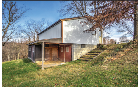
32'X 26' BANK BARN