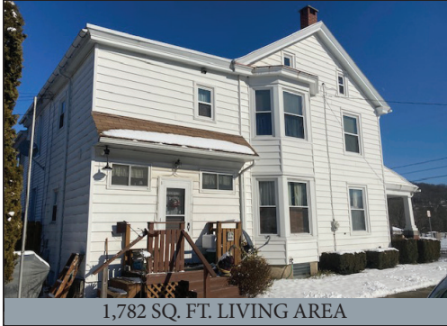
1,782 SQ. FT. LIVING AREA