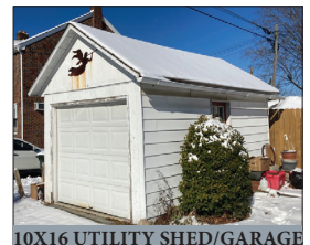
10X16 UTILITY SHED/GARAGE