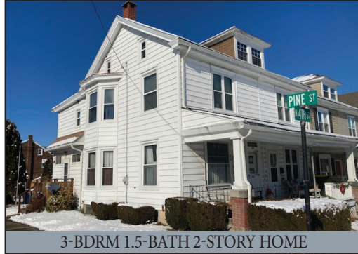
3-BDRM 1.5-BATH 2-STORY HOME