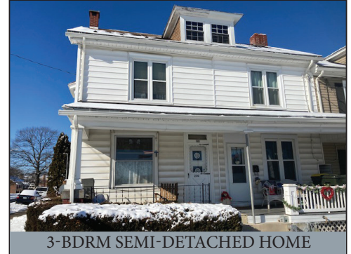
3-BDRM SEMI-DETACHED HOME

Located at 200 N. 4th Street Denver, PA Lancaster Co. Cocalico Schools