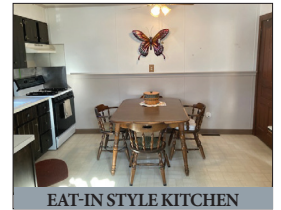
EAT-IN STYLE KITCHEN