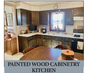
PAINTED WOOD CABINETRY KITCHEN

REAL ESTATE: consists of a 1,782 sq. ft. frame 2-story semi-detached 3-bedroom 1.5-bath dwelling on a corner lot. Main floor features a painted wood cabinetry kitchen w/gas range; breakfast area; ½-bath; 12'x12' formal dining room; 12'x10' living room; covered front porch; upper level includes 3-bedrooms & full bath w/shower/tub combo; unimproved basement w/laundry hook-up, washer & dryer included, oil forced warm air furnace/central AC; storage area; public water & sewer; annual taxes: $2,625. Outbuilding: a 10'x16' utility shed w/overhead garage door; Koi pond & patio area w/ privacy fence..