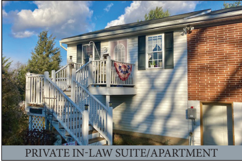
PRIVATE IN-LAW SUITE/APARTMENT