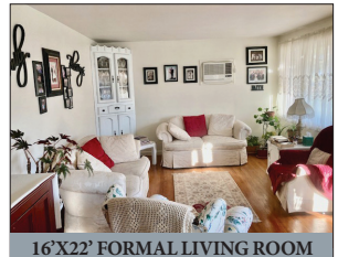
16'X22' FORMAL LIVING ROOM