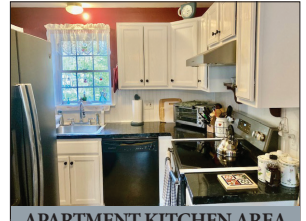
APARTMENT KITCHEN AREA