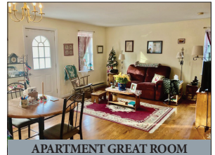
APARTMENT GREAT ROOM

FOR PHOTOS & COMPLETE LISTING VISIT www.martinandrutt.com