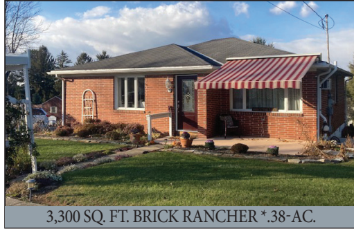
3,300 SQ. FT. BRICK RANCHER *.38-AC.