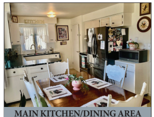
MAIN KITCHEN/DINING AREA