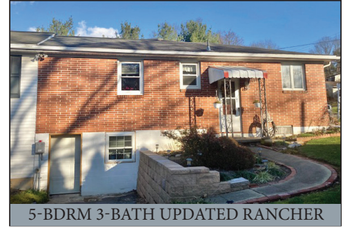
5-BDRM 3-BATH UPDATED RANCHER

Located at 126 Scenic View Dr. Ephrata, Pa. Ephrata Twp. Lancaster Co.