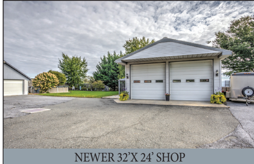
NEWER 32'X 24' SHOP