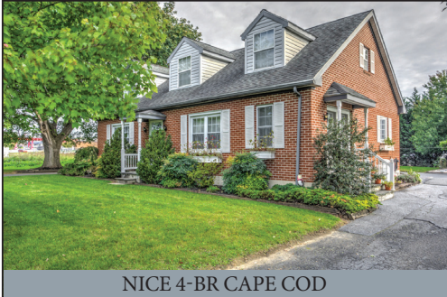
NICE 4-BR CAPE COD

BRICK CAPE-COD STYLE HOUSE w/ 4-BEDROOMS NEWER DETACHED 2-CAR GARAGE/SHOP * .46-ACRE VERY CLEAN & UPDATED HOUSE * NEW CIRCLE DRIVEWAY THURSDAY DECEMBER 7, 2023 @ 4:00 PM