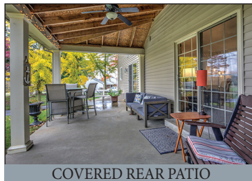
COVERED REAR PATIO