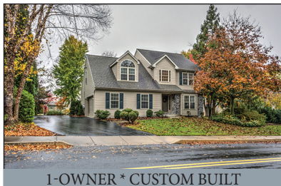
1-OWNER * CUSTOM BUILT