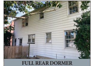
FULL REAR DORMER

REAL ESTATE: Consists of a spacious 2600 sq. ft. 4-bdrm 1.5 story (1950) dwelling w/attached 1-car garage, detached 1 & 2-car garages on a .46-acre lot. Main floor includes an eat-in style 15'x14' kitchen w/painted wood cabinetry; 12'x13' dining/family room; 13'x25' formal living room w/brick FP, access to covered side porch; powder room; attached 1-car garage; laundry/mud room; upper level includes 4-bedrooms w/closets & full bath; basement features a utility room; central AC/oil furnace forced air heat; 624 sq. ft. in-law quarters; efficiency kitchen; full bath; bedroom/hobby room; bonus room; walk-out access; public water & sewer; residential zoning; annual taxes: $3,187. Outbuildings: a masonry block 2-car garage; a frame 1-car garage; macadam drive & parking area; nice backyard & garden space.