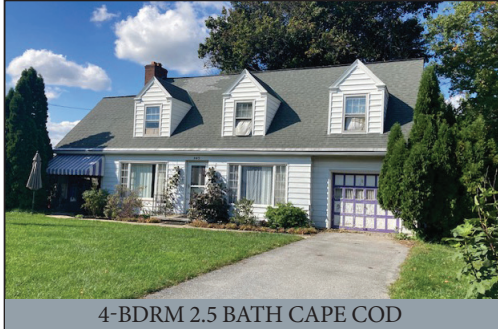
4-BDRM 2.5 BATH CAPE COD