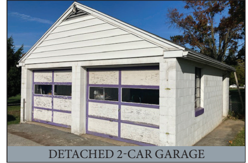
DETACHED 2-CAR GARAGE

Located at 965 E. Main St. New Holland, Pa. E. Earl Twp. Lancaster Co.