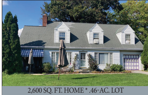
2,600 SQ. FT. HOME * .46-AC. LOT