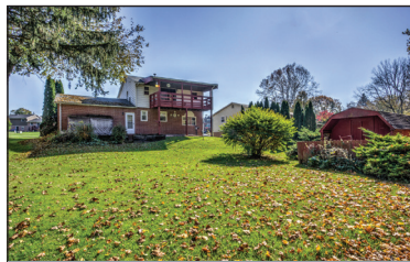
BACKYARD * COVERED BALCONY