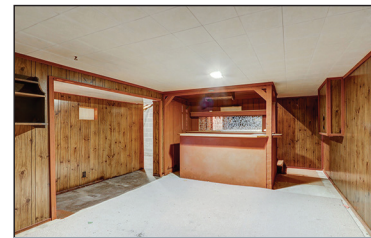
20' X 12' FINISHED BASEMENT

Located at 77 Circle Dr. Ephrata PA 17522