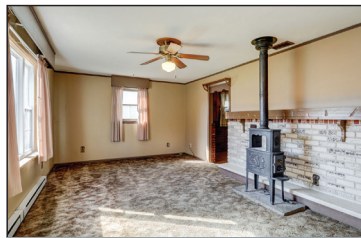
FRONT LIVING ROOM