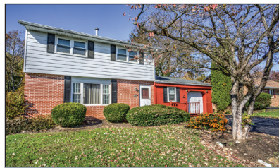
SOLID CONSTRUCTED HOUSE

AFFORDABLE 2-STORY HOUSE * 1-CAR GARAGE 3-BEDROOMS & 2-BATHS * BORDERS COCALICO CREEK .20-ACRE LEVEL LOT * WONDERFUL NEIGHBORHOOD TUESDAY, DECEMBER 12, 2023 @ 4:00 PM