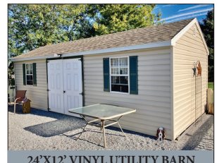
24'X12' VINYL UTILITY BARN