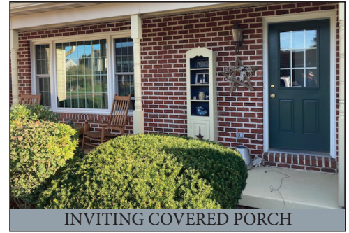
INVITING COVERED PORCH

Located at 234 Aspen St. New Holland, Pa. 17557