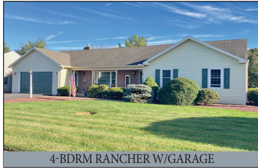
4-BDRM RANCHER W/GARAGE