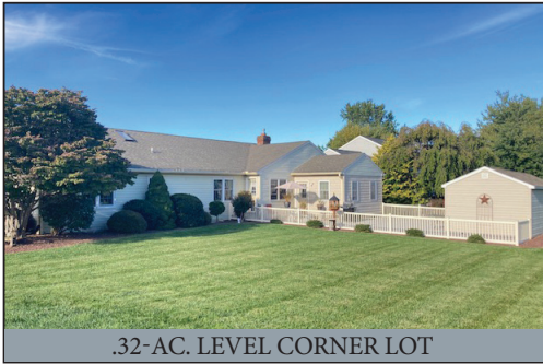
.32-AC. LEVEL CORNER LOT