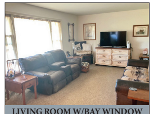
LIVING ROOM W/BAY WINDOW