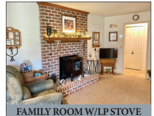
FAMILY ROOM W/LP STOVE