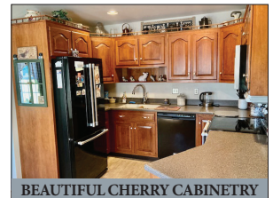
BEAUTIFUL CHERRY CABINETRY

FOR PHOTOS & COMPLETE LISTING VISIT www.martinandrutt.com