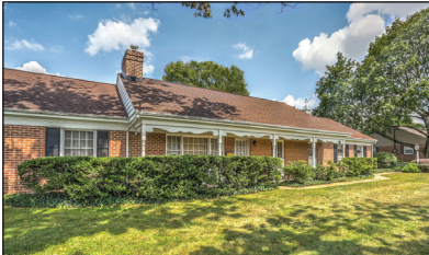
IMPRESSIVE BRICK RANCHER

SAT. OCTOBER 7, 2023 @ 8:30 AM * R.E. @ 1:00 PM