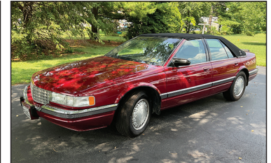
1992 CADILLAC (44-K)

Located at 41 Hillcrest Dr. Leola Pa. 17540