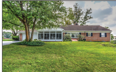
REAR ALL-SEASON ROOM