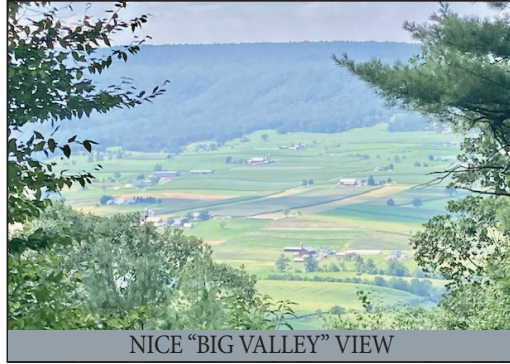
NICE "BIG VALLEY" VIEW