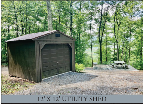
12' X 12' UTILITY SHED