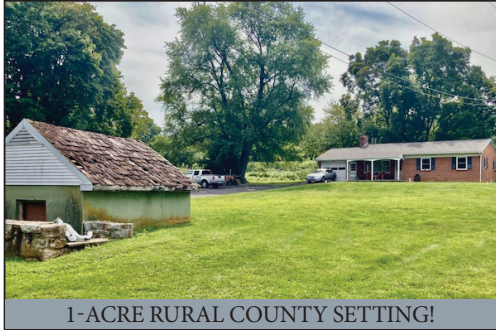
1-ACRE RURAL COUNTY SETTING!

3-BDRM 1.5-BATH BRICK RANCHER w/GARAGE * 1-AC. LOT! UTILITY SHED * SPRINGHOUSE & STREAM * 2009 BUICK LACROSSE MONDAY, OCTOBER 30, 2023 @ 5-PM