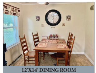
12'X14' DINING ROOM