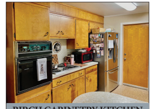
BIRCH CABINETRY KITCHEN