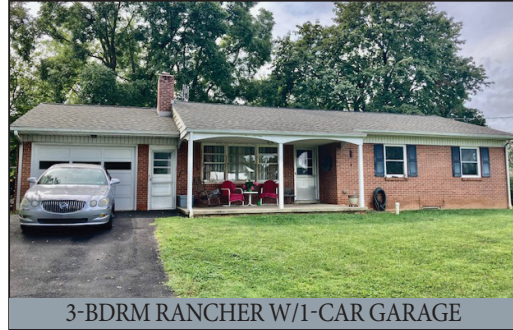
3-BDRM RANCHER W/1-CAR GARAGE