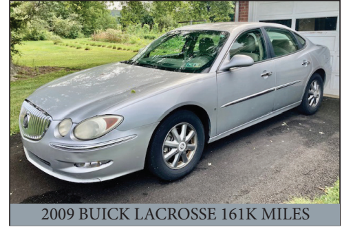
2009 BUICK LACROSSE 161K MILES

Located at 5473 Div. Hwy. Narvon, PA East Earl Twp. Lancaster Co.