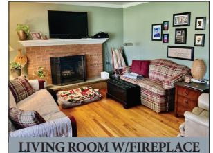
LIVING ROOM W/FIREPLACE

CAR: 2009 Buick Lacrosse 4-dr sedan, silver, 3.8L V-6, 161k miles, leather seats, power loaded, inspected thru 6-24, VIN#2G4WD582591237288.