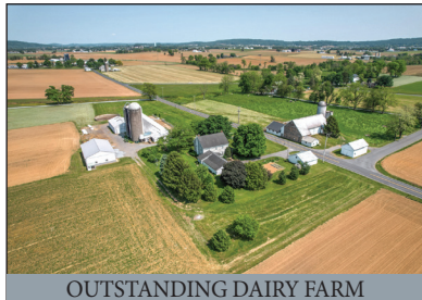
OUTSTANDING DAIRY FARM