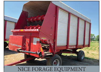
NICE FORAGE EQUIPMENT

Located at 600 Hackman Rd. Ephrata Pa. 17522