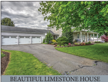
BEAUTIFUL LIMESTONE HOUSE

79-ACRE FARM * NEWER 64'x 40' EQUIP. BARN 56-TIE STALLS, 132'X 40' DAIRY BARN * (4) SILOS 50-HEAD HEIFER BARN * 62'-MANURE PIT HISTORIC LIMESTONE 4-BR HOUSE, MODERNIZED SAT. OCTOBER 21, 2023 @ 9-AM * RE @ 11-AM