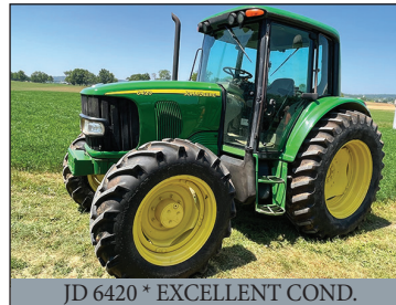
JD 6420 * EXCELLENT COND.