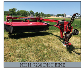
NH H-7230 DISC BINE

HOUSE LISTING: A stunning 79-acre dairy & crop farm w/ level fields and extremely productive soil. This very nice historic Limestone 2-story farmhouse includes a spacious eat-in kitchen w/ custom wood cabinetry built around an old stone walk-in fireplace, abundant counter space, large sink window, newer appliances; both living & family rooms; corner office w/ lots of windows & closet; laundry room; powder bathroom; rear mud room; roomy 3-car attached garage addition. Second level has 4-bedrooms; closet storage; full bathroom w/ tub shower; unimproved basement. Oil furnace radiator heat; private well & septic; updated windows; deep window sills; good roof; many upgrades thru-out; come and take a look.