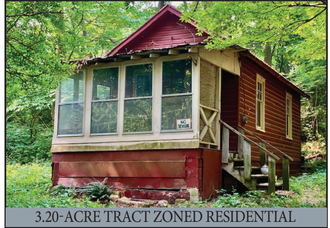
3.20-ACRE TRACT ZONED RESIDENTIAL

Located at along Keneagy Hill Rd. Paradise, Pa. Paradise Twp. Lancaster Co.