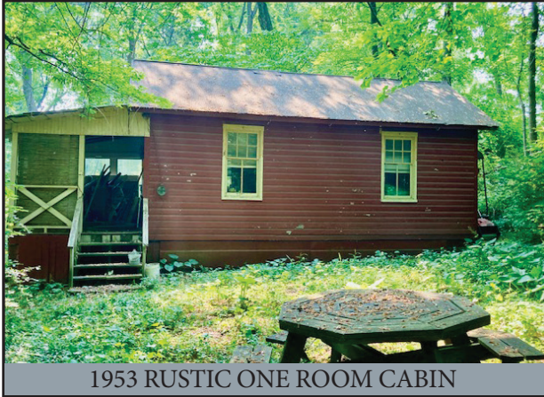
1953 RUSTIC ONE ROOM CABIN