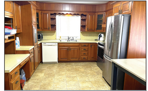
SPACIOUS EAT-IN KITCHEN

Located at 385 Creek Rd. Denver Pa. 17517