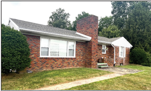
3-BR ALL-BRICK RANCHER