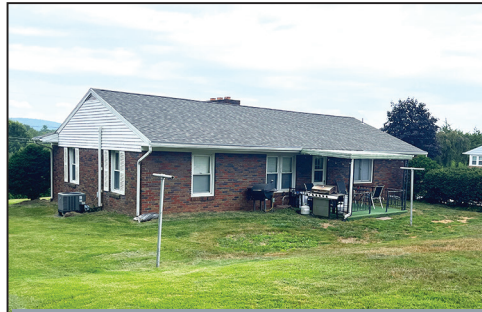
BACK OF HOUSE & PATIO