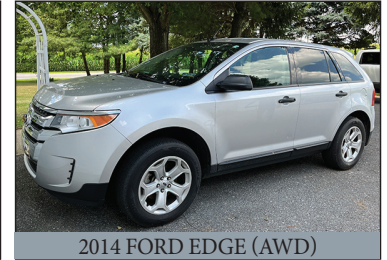
2014 FORD EDGE (AWD)