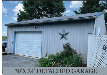
30'X 24' DETACHED GARAGE