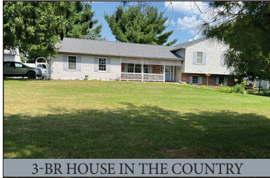
3-BR HOUSE IN THE COUNTRY

1-ACRE COUNTRY LOT * 3-BR SPLIT-LEVEL HOUSE DETACHED GARAGE & SHOP * DAYLIGHT BASEMENT VEHICLES * TOOLS * COLLECTIBLES * H-H ITEMS SATURDAY, SEPTEMBER 30, 2023 @ 8-AM * R.E. @ 1-PM