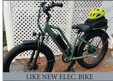
LIKE NEW ELEC. BIKE