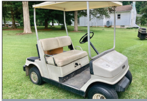
YAMAHA GOLF CART

Located at 1042 Locust Grove Rd. Middletown, Pa. Londonderry Twp. Dauphin Co.