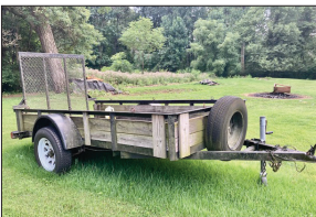
10'X5' OPEN TRAILER

GUNS & FISHING: Guns Not On Premises: Winchester mod 1200 .12-ga; Remington pellet gun; BB gun; Winchester 1300XTR .12-ga; early US Springfield percussion gun; Ruger 77/22 .22 rifle w/2.5x32 scope; Savage 24V .222/.20-ga O/U w/scope; Winchester mod 70 30.06 w/3x9 scope; Western Field .20-ga pump; Winchester mod 12 .12-ga pump; .22-cal single shot rifle; Remington mod 700 7MM Mag. (NIB); (Handguns to be Registered @ Kinsey's) Centennial .22 9-shot revolver; Colt Trooper MKIII .357 Mag CTG revolver; Ruger .357 revolver; Smith & Wesson .22 pistol w/holster; High Standard .22 pistol; lots of misc. ammo; 20+ fishing rods; reels; tackle; gear; nets; game mounts; gun cleaning kit; hunting & trapping items; pelts.