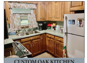
CUSTOM OAK KITCHEN