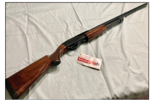
WINCHESTER 1300XRT 12-GA.

GOLF CART & LAWN ITEMS: Yamaha gas golf cart; 10'x5' single-axle open trailer; Toro Z-Turn mower w/bagger; 14hp riding mower 42" cut; leaf cart; MTD 10hp 29" snow blower; spin-spreader; 3-Stihl chain saws; shovels; rakes; etc; nylon ropes; ext cords; live traps; 12'x18' canopy; tarps; ice chests; bird houses.