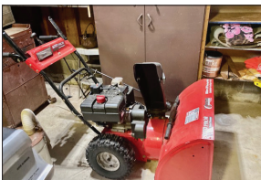
10HP MTD SNOW BLOWER

PERSONAL PROPERTY: Upright Freezer; Maytag washer & dryer; dorm fridge; 17-cu. ft. fridge; Weber grill; Regulator wall clock; 2-safes; SS cookware; lots of kitchen & baking items; roasters; old bottles; luggage; dbl bed & dresser; desk; bookshelf; rocker; loveseat; duck stamp prints; cedar cupboard; plus much more.