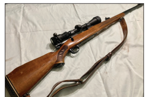
RUGER 77/22 .22-RIFLE

TOOLS & SHOP ITEMS: Craftsman 10" radial arm saw; 10" table saw; drill press; scroll saw; large tool box w/vise; bench grinder; bench vises; organizers; tool cabinets; miter chop-saw; wood clamps; levels; lots of wood working hand tools; shop vac; step ladders; air compressor; wrench & socket sets; bit sets; metal shelving; lots of tool tray lots.