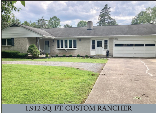
1,912 SQ. FT. CUSTOM RANCHER

SATURDAY, SEPTEMBER 23, 2023 @ 9-AM/Real Estate @ 1-PM