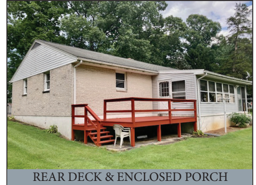
REAR DECK & ENCLOSED PORCH

Located at 1042 Locust Grove Rd. Middletown, Pa. Londonderry Twp. Dauphin Co.