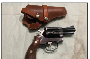
SMITH & WESSON .22-PISTOL

TERMS: CASH/PA CHECK or CREDIT CARD w/3% FEE; Food Stand Available; Sale Held Under Tent Bring A Chair.