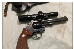
RUGER .357 REVOLVER

PERSONAL PROPERTY: Upright Freezer; Maytag washer & dryer; dorm fridge; 17-cu. ft. fridge; Weber grill; Regulator wall clock; 2-safes; SS cookware; lots of kitchen & baking items; roasters; old bottles; luggage; dbl bed & dresser; desk; bookshelf; rocker; loveseat; duck stamp prints; cedar cupboard; plus much more.