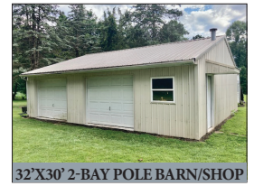
32'X30' 2-BAY POLE BARN/SHOP