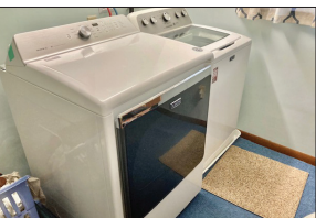
MAYTAG WASHER & DRYER

TERMS: CASH/PA CHECK or CREDIT CARD w/3% FEE; Food Stand Available; Sale Held Under Tent Bring A Chair.