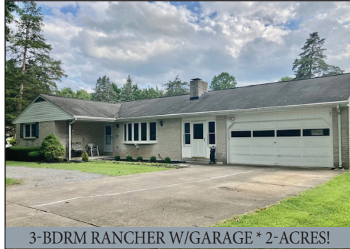
3-BDRM RANCHER W/GARAGE * 2-ACRES!