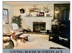
LIVING ROOM W/FIREPLACE