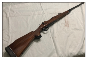
REMINGTON #700 7MM MAG (NIB)

GUNS & FISHING: Guns Not On Premises: Winchester mod 1200 .12-ga; Remington pellet gun; BB gun; Winchester 1300XTR .12-ga; early US Springfield percussion gun; Ruger 77/22 .22 rifle w/2.5x32 scope; Savage 24V .222/.20-ga O/U w/scope; Winchester mod 70 30.06 w/3x9 scope; Western Field .20-ga pump; Winchester mod 12 .12-ga pump; .22-cal single shot rifle; Remington mod 700 7MM Mag. (NIB); (Handguns to be Registered @ Kinsey's) Centennial .22 9-shot revolver; Colt Trooper MKIII .357 Mag CTG revolver; Ruger .357 revolver; Smith & Wesson .22 pistol w/holster; High Standard .22 pistol; lots of misc. ammo; 20+ fishing rods; reels; tackle; gear; nets; game mounts; gun cleaning kit; hunting & trapping items; pelts.