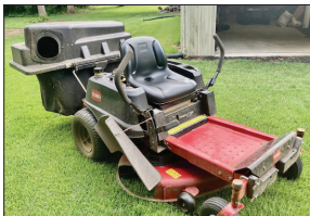
TORO Z-TURN MOWER

TOOLS & SHOP ITEMS: Craftsman 10" radial arm saw; 10" table saw; drill press; scroll saw; large tool box w/vise; bench grinder; bench vises; organizers; tool cabinets; miter chop-saw; wood clamps; levels; lots of wood working hand tools; shop vac; step ladders; air compressor; wrench & socket sets; bit sets; metal shelving; lots of tool tray lots.