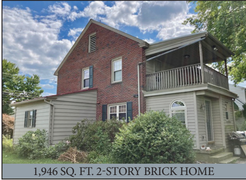
1,946 SQ. FT. 2-STORY BRICK HOME

3-BDRM 1.5 BATH 2-STORY BRICK HOME * .51-AC. LOT DETACHED 3-CAR GARAGE * CUSTOM MAPLE KITCHEN THURSDAY, SEPTEMBER 21, 2023 @ 6:30 PM