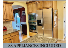
SS APPLIANCES INCLUDED