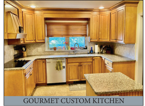
GOURMET CUSTOM KITCHEN

Located at 969 E. Main St. New Holland, Pa. E. Earl Twp. Lancaster Co.