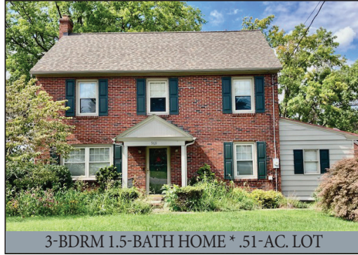
3-BDRM 1.5-BATH HOME * .51-AC. LOT