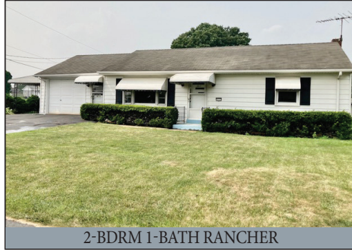
2-BDRM 1-BATH RANCHER