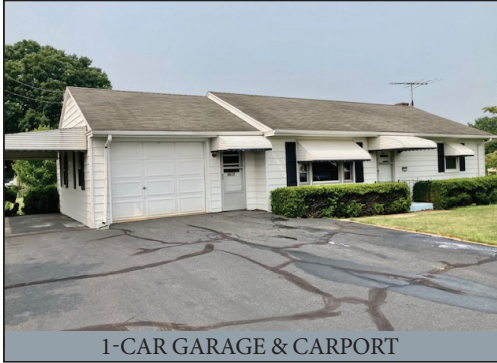
1-CAR GARAGE & CARPORT