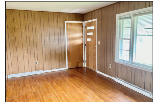
LIVING ROOM W/BAY WINDOW