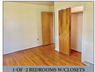
1-OF-2 BEDROOMS W/CLOSETS