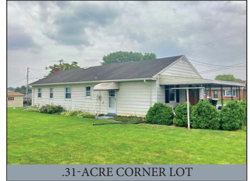
.31-ACRE CORNER LOT

Located at 3617 Lilac Ave. Gordonville, Pa. Leacock Twp. Lancaster Co.