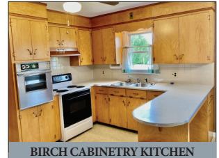
BIRCH CABINERY KITCHEN

For photos & complete listing visit www.martinandrutt.com