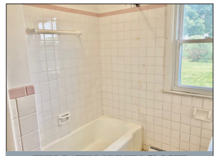
FULL BATH W/LINEN CLOSET