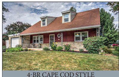
4-BR CAPE COD STYLE

4-BEDROOM BRICK CAPE-COD * LEVEL .29-ACRE 2.5-BATHS * EAT-IN KITCHEN * FINISHED BASEMENT MONDAY, SEPTEMBER 11, 2023 @ 5:30 PM