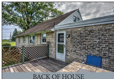
BACK OF HOUSE