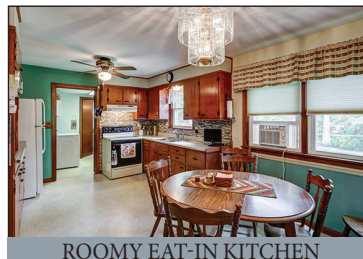
ROOMY EAT-IN KITCHEN