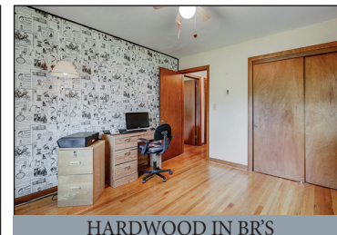
HARDWOOD IN BR'S

Located at 49 Cedar Ave. Brownstown Pa. 17508