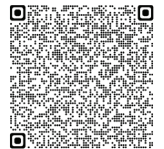
SCAN TO VIEW

PERSONAL PROPERTY: Black 2006 Nissan Frontier pickup, SE model, 4WD, 1.5 cab, 118,000 miles, w/ newer Snow-Dog 80" snow-plow attachment; Amana fridge w/ freezer bottom; chest freezer; GE front load washer & dryer; Bernina ACTIVA-230 digital sewing machine; 8,000 btu window A/C; Basic-Witz walnut mid-century chest & dresser; solid cedar blanket chest; exten. table w/ 10 boards & 6-plank seat chairs; oak glider rocker; oak bookshelf; oak clothes tree; antique painted wood benches; (2) queen boxspring & mattress sets; oak changing table; cherry childs table & 2 chairs; org. Pequea church bench; 3-pc pine bedroom suite; lazy-boy recliners; plaid sofa; picnic table & benches; microwave & stand; 10-speed bike; lawn chairs; croquet set; soft goods & blankets; children's toys; misc. Christian reading books; kitchen utensils; noodle maker; marble roller; local truck banks; toy trucks; Costco step stool; rebounder; mtn pie makers; 28' alum. ext. ladder; alum. lawn mower ramps; lawn dump trailer; Kobalt air compressor; live trap; ext. cords; 75-K ready heater; Milwaukee angle grinder; Parmac fence charger; Poulan 14" trim saw; Jackson 36" drop spreader; good hand tools, canning jars; plus more unlisted.