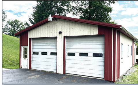
35'X 29' DETACHED GARAGE