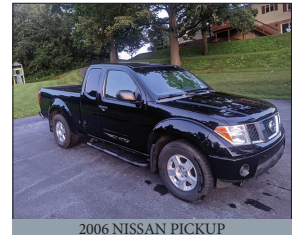
2006 NISSAN PICKUP

LISTING DETAILS: A very clean 2-story colonial style house has 5 bedrooms w/ both attached & detached garages on 1.3-acre lot. House was built in 1987, is 2,324 sq. ft. w/ additional 1,000 in daylight basement. Main level has 21.5'x 14.5' eat-in kitchen w/ wooden cabinetry, dishwasher, sink window, Bay-style window in seating area; open to 16'x 13.5' front living room w/ banister; 12'x 12' primary bedroom w/ double closet; 14'x 14' formal family room; 14'x 8.5' laundry & mud room w/ large coat closet; full bathroom w/ shower stall; 23'x 23' attached 2-car garage; treated-wood rear 14'x 10' deck; 25'x 6' covered front porch. Second level has 16'x 12' BR #2 w/ double closet; 14'x 12' BR #3 w/ double closet; 14'x 13' BR #4 w/ double closet; 14'x 14' BR #5 w/ closet; full bathroom w/ tub shower. Daylight basement has unimproved 28'x 19' center room w/ patio door; 14'x 13' hobby room or 6th BR w/ closets; 14'x 14' utility room; 14'x 12' furnace room; whole house fan; updated roof; oil furnace w/ H/W baseboard heat; central vac.; mini-split A/C unit; on-site well & septic; new doors on North side; double pane windows.