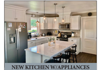
NEW KITCHEN W/APPLIANCES

For photos & complete listing visit www.martinandrutt.com