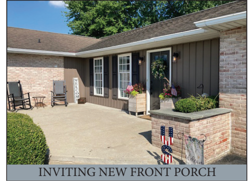
INVITING NEW FRONT PORCH

Located at 214 E. Spruce St. New Holland, PA 17557