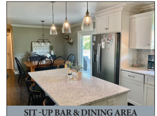
SIT-UP BAR & DINING AREA