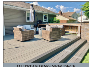
OUTSTANDING NEW DECK