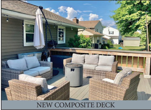
NEW COMPOSITE DECK