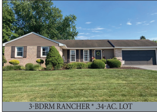
3-BDRM RANCHER * .34-AC. LOT