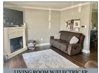
LIVING ROOM W/ELECTRIC FP