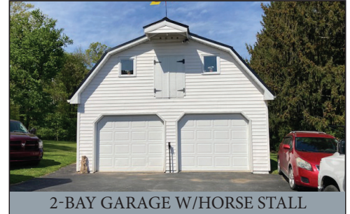
2-BAY GARAGE W/HORSE STALL

Located at 620 Sawmill Rd. East Earl, Pa. East Earl Twp. Lancaster Co.