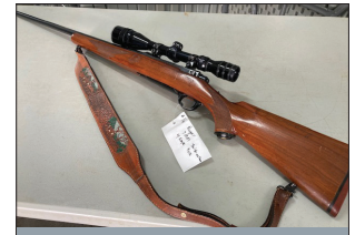
RUGER M77 25-06 REM

TERMS: Cash, PA check or credit card w/3% fee; sale held under tent, bring a chair; food by Martindale FC aux.; lots of nice clean items & valuable antiques!