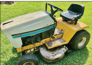
CUB CADET 1320 W/38" CUT