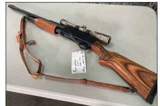
WIN. #1300 .12-GA PUMP