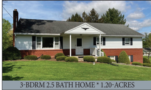
3-BDRM 2.5 BATH HOME * 1.20-ACRES