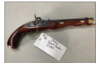
BLACK POWDER PISTOL