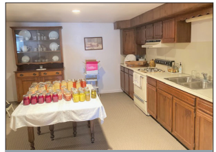
2ND KITCHEN & DINING AREA