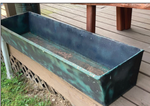
LEACOCK FOUNDRY TROUGH