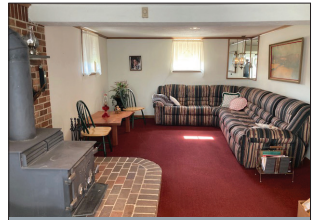
FAMILY ROOM W/WOODSTOVE