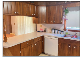
MAIN LEVEL CUSTOM KITCHEN