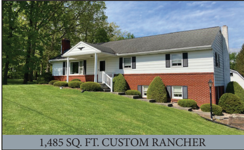
1,485 SQ. FT. CUSTOM RANCHER

3-BDRM 2.5-BATH CUSTOM RANCHER * 1.20-ACRE LOT! 2-STORY 2-BAY GARAGE/HORSE BARN * UTILITY SHEDS GUNS & AMMO * ANTIQUES * TOOLS * SANDSTONE TROUGHS MILK BOTTLES * QUILTS * FURNITURE & PERSONAL PROPERTY SAT. AUG. 26, 2023 @ 9-AM/Real Estate @ 2-PM