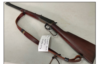
WIN. #94 .32-CAL RIFLE