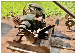
MAYTAG 1.5HP ENGINE

PERSONAL PROPERTY & ANTIQUES: Speed Queen washer & dryer; oak wash stand; oak ext table w/8-leaves; 2-Singer Featherweight sewing machines; sewing supplies & table; 4-drawer oak chest; toy box; hutch; old bookcase w/mirror; sectional sofa; power lift chair; tan sofa; mid-century dinette set; 2-benches; cane seat chair; slab wood coffee table; slab wood picnic table set; quilts & blankets; SS cookware & baking items; Sunbeam mixer; crock pot; books; old marbles; croquet set; lanterns; milk bottles (Wentzel, Terre Hill) plus others; 8-old milk cans; cigar molds; old saw blades; scythe; old shutters; wooden yoke; old whiskey barrels & kegs; wooden wheel; old galvanized tubs & pails; 2-traffic lights; pitcher pump; old cast iron barn items; green jars & insulators; ice tongs; etc.