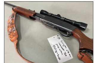
REM. .270 #760 RIFLE