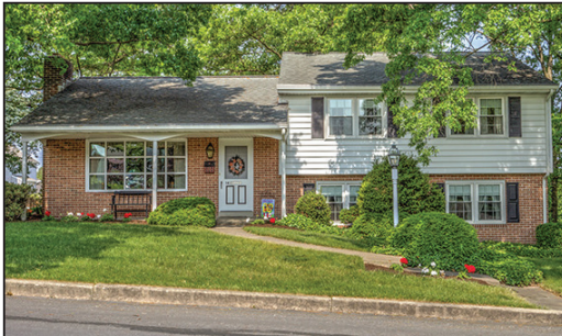
STREET VIEW * 3-BR

.38-ACRE * BEAUTIFUL MULTI-LEVEL HOUSE * 3-BR 1-OWNER * ATTACHED 2-CAR GARAGE * CLEAN BUILDING LOT OFFERED TOGETHER & SEPARATE THURSDAY AUGUST 24, 2023 @ 6:00 PM