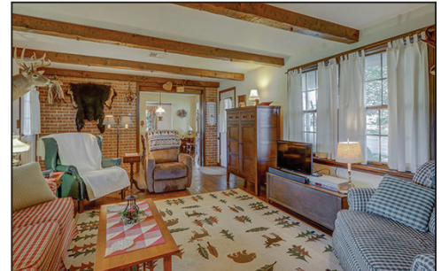
GREAT LIVING ROOM

Located at 14 S 4th St, Akron, PA 17501 * Akron Boro