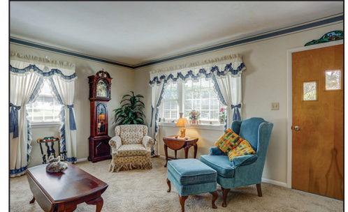
FRONT LIVING ROOM

Located at 274 Sprecher Rd. Lancaster Pa. 17603