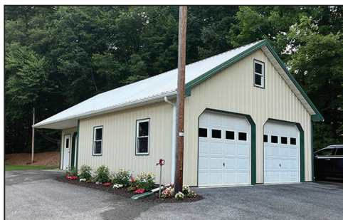
42'X 25' GARAGE & SHOP