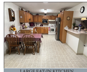
LARGE EAT-IN KITCHEN

LISTING DETAILS: A very clean 1.5-story house and detached buildings on 1.73-acre open & wooded lot. House is built in 1958, approx. 1,769 sq. ft. w/ a total of 2,100+ total finished; has 23'x 11.5' eat-in kitchen w/ Oak cabinetry, eat-at counter, built-in dishwasher; 23'x 14.5' living room addition w/ front door & rear patio doors to concrete patio & 24'x 12' treated wood deck; rear 20'x 11.5' family room w/ propane stove; primary 15'x 12' bedroom w/ walk-in closet & private entrance to common area full bathroom & tub shower; 11'x 11' bedroom #2 w/ closet; hall closet; 12'x 6' laundry room w/ sink & cabinetry; half bathroom. Second level has 12'x 11' bedroom #3 w/ abundant closets; walk-thru storage room w/ oversized closet. Lower level daylight on gable-end; walk-out/entrance door; 21'x 14' recreation room w/ closet & wall-to-wall carpet; propane wall mounted furnace; 17'x 6' canning & freezer room. Propane (2 500-gallon tanks) & elec. baseboard heat; some updated windows; updated vinyl siding; elec. water heater; on-site well w/ water softener & on-site septic. Outstanding secluded back-yard w/ fire pit area great for entertaining and picnics.