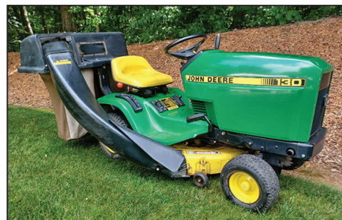
JOHN DEERE #130

Located at 1218 Kramer Mill Rd. Denver Pa 17517