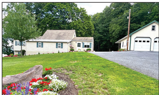
3-BR HOUSE & SHOP

1.5-STORY HOUSE * MAIN LEVEL BR's * OPEN KITCHEN 1.73-ACRES w/ NICE YARD * 42'x 25' DETACHED GARAGE GUNS * JOHN DEERE MOWER * TOOLS * FURNITURE MONDAY, AUGUST 14, 2023 @ 5:00 PM * R.E. @ 6:00 PM