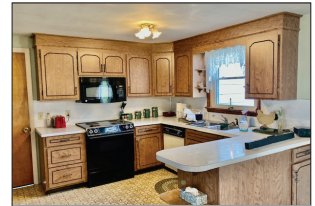
OAK CABINETY KITCHEN

REAL ESTATE: Consists of a (1968) one-owner 1,334 sq. ft. 3-bedroom rancher w/attached 1-car garage on a .38-ac. rural lot. Main floor includes an oak cabinetry kitchen w/pantry, range, microwave, DW & refrigerator; 12'x14' dining room w/patio doors to rear 12'x18' private deck; 14'x18' living room w/bay window; full bath w/linen closet; 3-bedrooms w/closets; attached 1-car garage w/laundry hook-up; 16'x12' utility room w/powder room & laundry tub; 1,334 sq. ft. basement w/concrete floor & Bilco egress door; utility room w/oil furnace forced air heat; on-site well & septic system; annual taxes: $2,976. New roof (5-yrs); insulated windows & doors; house is currently a rental @ $800/month.