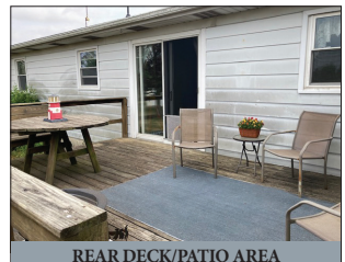
REAR DECK/PATIO AREA