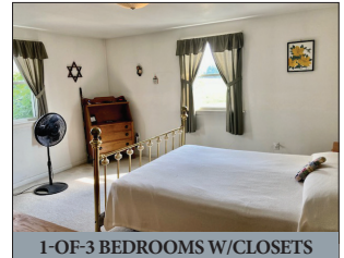
1-OF-3 BEDROOMS W/CLOSETS