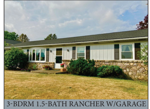
3-BDRM 1.5-BATH RANCHER W/GARAGE

Located at 616 S. Kinzer Ave. New Holland, Pa. Earl Twp. Lancaster Co.