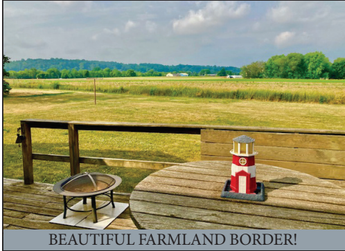
BEAUTIFUL FARMLAND BORDER!

3-BDRM 1.5-BATH RANCHER w/1-CAR GARAGE * .38-AC. LOT 1,334 Sq. Ft. ONE-OWNER (1968) HOME w/ RENTAL INCOME! TUESDAY, AUGUST 1, 2023 @ 6:30-PM