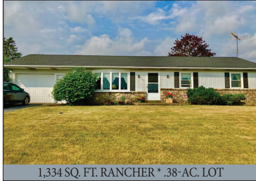
1,334 SQ. FT. RANCHER * .38-AC. LOT