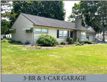
3-BR & 3-CAR GARAGE

.87-ACRE LEVEL LOT * 3-BR RANCHER * NICE YARD DETACHED BARN * ATTACHED 3-CAR GARAGE * CORNER LOT MOTORCYCLES * GARAGE ITEMS * TOOLS * ANTIQUES SATURDAY, JULY 29, 2023 @ 8:30 AM * R.E. @ 1:00 PM