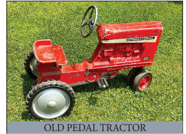
OLD PEDAL TRACTOR

Located at 3738 E. Newport Rd. Gordonville Pa. 17529