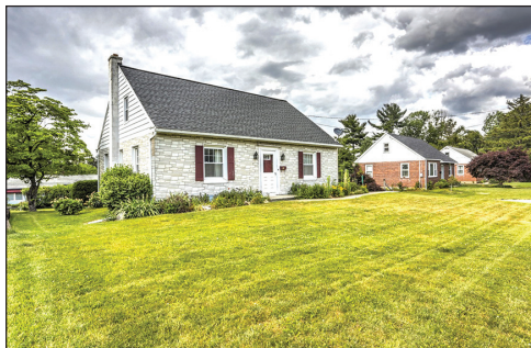
SOLID HOUSE * 3-BEDROOMS

3-BEDROOM 1.5-STORY HOUSE * LOW MAINTENANCE NEWER ROOF & VINYL WINDOWS * DETACHED GARAGE HARDWOOD FLOORING THRU-OUT * 2004 CADILLAC CTS THURSDAY, JULY 27, 2023 @ 6:00 PM