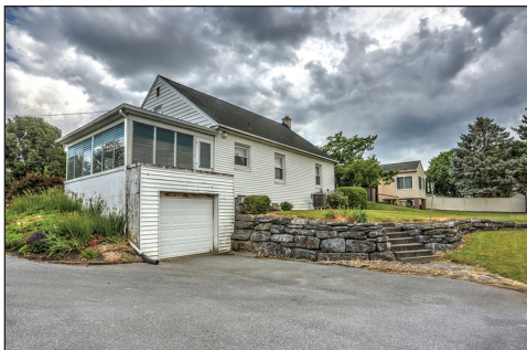
BACK OF HOUSE