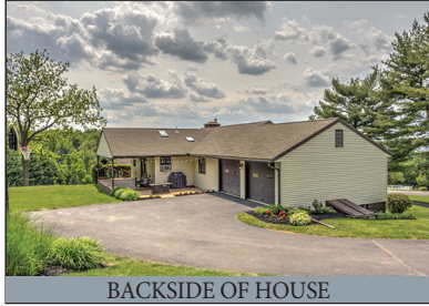
BACKSIDE OF HOUSE