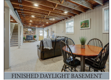
FINISHED DAYLIGHT BASEMENT

Located at 873 Ridge Ave. Ephrata Pa. 17522 * E. Cocalico Twp.