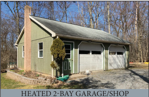
Located at 2323 Laurel Top Circle, Narvon, PA. Caernarvon Twp. Lancaster Co.

DIRECTIONS: From Churchtown Rt. 23 take Churchtown Rd. N. to right on Hammertown Rd. left on Edwards Rd. left on Poplar left on Laurel Ridge left on Laurel Top Cir. to sale on left. Or, from Rt. 625 south of Bowmansville take Laurel Rd. E to right on Poplar to right on Laurel Ridge.