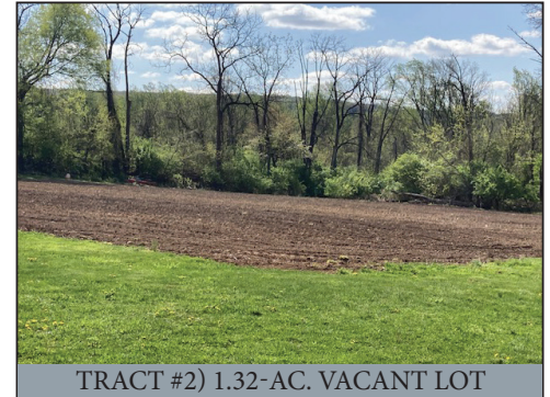
TRACT #2) 1.32-AC. VACANT LOT

Located at 59 Hartz Rd. Fleetwood, Pa. Alsace Twp. Berks Co.