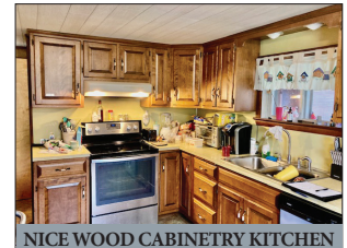
NICE WOOD CABINETRY KITCHEN

REAL ESTATE: Consists of a 3-bedroom 1,288 sq. ft. rancher on a rural .51-acre lot. Main floor features a nice eat-in style maple cabinetry kitchen w/appliances & pantry; 10'x14' 3-seasons sunroom; 14'x18' living room w/stone fireplace & HW flooring; updated full bath; 3-bedrooms w/closets; lower level includes ground level egress door; a 20'x24' family room w/FP & wood burning insert; 14'x20' workshop area; 14'x20' utility room w/laundry; oil furnace; central AC; on-site well & septic; nice circle driveway & parking area; rear deck & patio; utility shed; annual taxes: $3,227; home currently rented @ $800/mo.