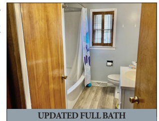
UPDATED FULL BATH

TRACT #2: Consists of a level residential zoned 1.32-acre lot adjacent to tract #1 with 75' frontage along Hartz Rd. Ideally suited for a custom home site! Annual taxes: $101. Both properties will be offered individually or jointly.