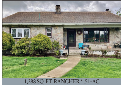
1,288 SQ. FT. RANCHER * .51-AC.