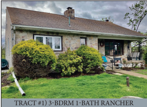
TRACT #1) 3-BDRM 1-BATH RANCHER

#1) 3-BDRM 1-BATH 1,288 Sq. Ft. RANCHER * .51-AC. LOT #2) 1.32-ACRE VACANT LOT * IDEAL CUSTOM HOME SITE ** BOTH SELL @ 27 HARTZ RD. FARM AUCTION LOCATION ** THURSDAY, JUNE 29, 2023 @ 6-PM