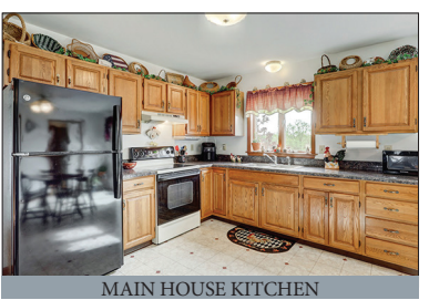
Located at 210 S. Windy Mansion Rd. Denver Pa. 17517

DIRECTIONS: From Rt. 897, turn South on S. Windy Mansion Rd, cross over Blue Lake Rd. to first property on the left.