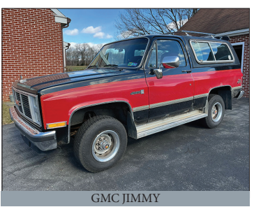
Located at 31 Rawlinsville Rd. Willow Street Pa. 17584

DIRECTIONS: From Rt. 272 on the South side of Willow Street, turn West on Baumgardner Rd, go ½ mile and turn left on Rawlinsville Rd, travel 600 ft. to property on left.